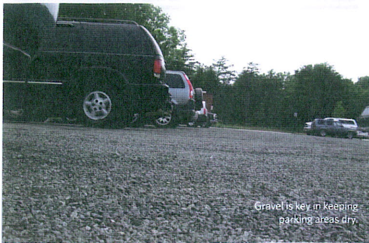
Gravel is key in keeping parking areas dry.