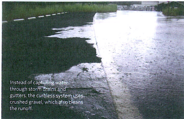
Instead of capturing water through storm drains and gutters, the curbless system uses crushed gravel, which also cleans the runoff.