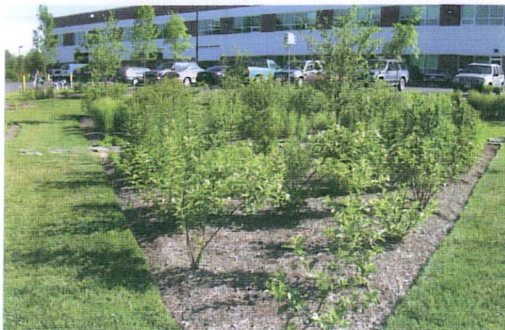
Everywhere people look, they see evidence that WSSI's site is different from most office locations.

dams that filter pollutants, to the existing stream. The swale follows a sinuous route, slowing the water down so that the stream isn't overwhelmed during a storm event. The swale, like the rest of the site, is extensively planted with native landscaping.