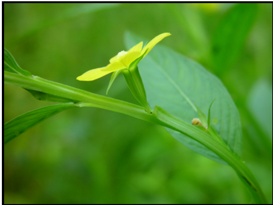
Ludwigia decurrens Walt. (Wing-Leaf Primrose-Willow)