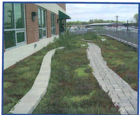
The rooftop rain garden at Wetlands Studies and Solutions in Gainesville, VA.

The WSSI building was constructed using low impact development techniques to manage its stormwater, and is certified "Gold" under the Leadership in Energy and Environmental Design for Commercial Interiors (LEED-CI) standards, set forth by the U.S. Green Building Council. This LEED program is voluntary and allows developers to be recognized as environmentally-conscious in design, engineering and construction. The WSSI building featured a rooftop rain garden (pictured at right) and underground gravel bed detention system, reflective and "green" roof, native landscaping, pervious surfaces, and downward-directed lighting into the site. The interior was also "environmentally-friendly" and featured sensors for lighting, individually-controlled thermal comfort zones, emission-free fabrics and surfaces, and individual task lighting for employees. (continued on page 9)