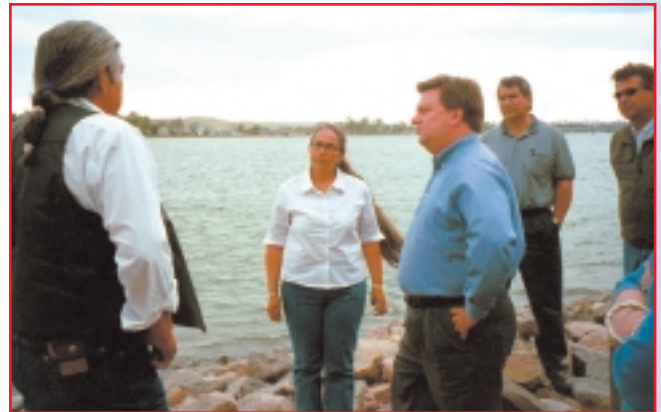
To better provide the Army Corps of Engineers input regarding their management of the Missouri River Mainstem and its impacts on archeological and other historic properties, Indian Tribes and the public toured sites along the river after a public meeting convened by the ACHP.

These and many other Federal actions can harm historic properties. Section 106 review is your opportunity to alert the Federal Government to the historic properties you value and to influence decisions about the Federal projects that affect them.