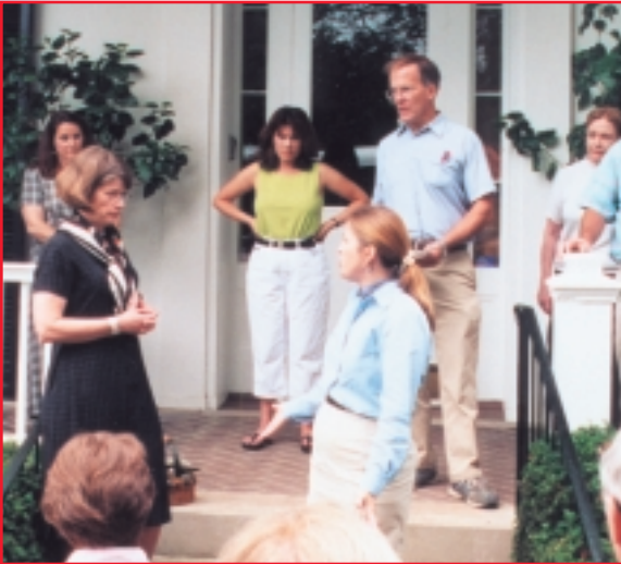
Local groups met with State agencies and city officials to discuss highway improvement plans to ease traffic congestion between Kentucky and Indiana. They expressed concern about the potential effect on sites such as the historic Swartz Farm.

When requesting consulting party status, explain why you believe your participation would be valuable to successful resolution. Since the SHPO/tribe will assist the Federal agency in deciding who will participate in the consultation, be sure to provide the SHPO/tribe with a copy of your letter to the agency.