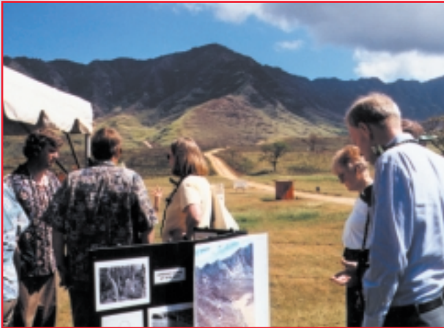
Citizen participation in the Section 106 process balances preservation with ongoing uses of historic properties, as demonstrated at the Makua Military Reservation in Hawaii. Rich in archeological resources, the site is used by the U.S. Army for live ammunition fire training.

If you are concerned about a proposed project and wondering whether Section 106 applies, you must first determine whether the Federal Government is involved. Will a Federal agency fund or carry out the project? Is a Federal permit, license, or approval needed? Section 106 applies only if a Federal agency is taking an action, so confirming Federal involvement is key.