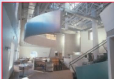
The American Can Company industrial complex in Baltimore was slated for demolition using Department of Housing and Urban Development funds. Citizen groups opposed the project, the ACHP held public meetings, and the buildings were ultimately rehabilitated for commercial use.

In the National Historic Preservation Act (NHPA), Congress established a comprehensive program to preserve the historical and cultural foundations of the Nation as a living part of community life. Section 106 of NHPA is crucial to that program, because it requires