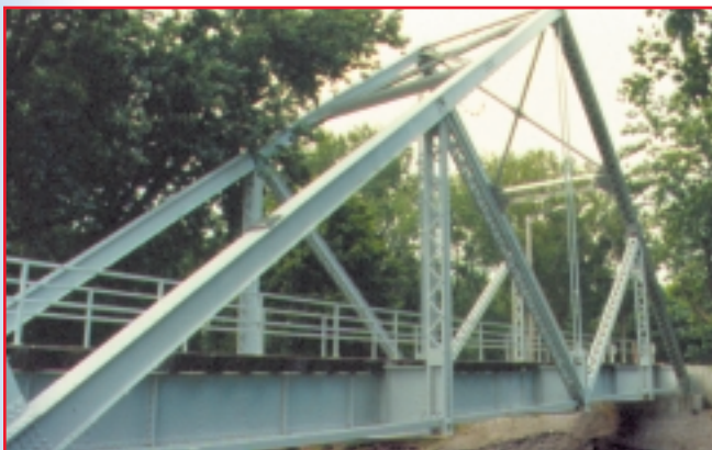
Under a Section 106 agreement, the U.S. Army Corps of Engineers dismantled and stored one of the Nation's last historic Waddell A-Truss bridges to save it from flood damage during construction of Smithville Lake in Missouri. Collaborative efforts led to its reconstruction in a local riverside park.

Sometimes Federal involvement is obvious. More often, the answer is not immediately apparent. If you have a question, contact the project sponsor to obtain additional information and to inquire about Federal involvement. All Federal agencies have Web sites, many listing regional or local contacts and information on major projects. The SHPO/tribe, State or local planning commissions, or statewide historic preservation organizations may also have project information.