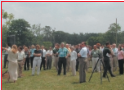
Preservation advocates' involvement with plans to widen Paris Pike, a historic road in the heart of Kentucky's bluegrass region, encouraged highway officials to add landscape architects and preservationists to the design team. The result is a road that's both efficient and in context with its setting.

A vigilant public helps ensure that Federal agencies comply fully with Section 106. In response to requests, the ACHP can investigate questionable actions and advise agencies to do what is required. As a last resort, preservation groups or individuals can litigate in order to enforce Section 106.