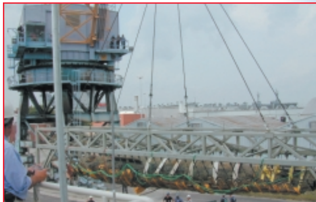
The Confederate submarine H.L. Hunley, which successfully completed the world's first submarine attack on a surface ship, was raised from the ocean floor through funding by an unprecedented collaboration among Federal and State agencies, private-sector organizations, corporations, and individuals.

Section 106 review gives you a chance to weigh in when Federal actions will affect historic properties you care about. Seize that chance and make a difference!