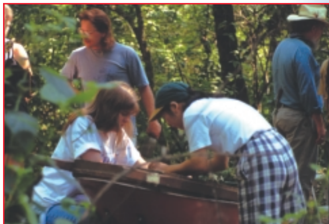
U.S. Fish and Wildlife Service collaborated with the Chinook Tribe and Portland State University to interpret the Cathlapotle archeological site in Washington State. To foster better understanding of the site, the partners developed tours, an archeology festival, and educational programs.

When the Federal agency releases information about project alternatives under consideration, make it aware of the options you believe would be most beneficial. To support alternatives that would preserve historic properties, be prepared to discuss costs and how well your preferred alternatives would meet project needs. Sharing success stories about the treatment or reuse of similar resources can be helpful.